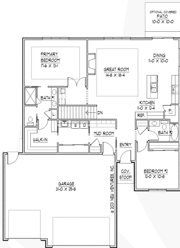
MAIN LEVEL FLOOR PLAN (1,608 SF MAIN, 815 SF GARAGE)